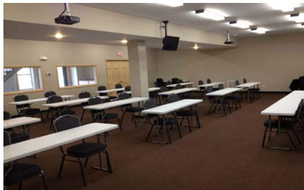
Conference and Training Room