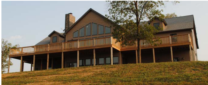
The Clubhouse at Top Gun Sportsman's Club